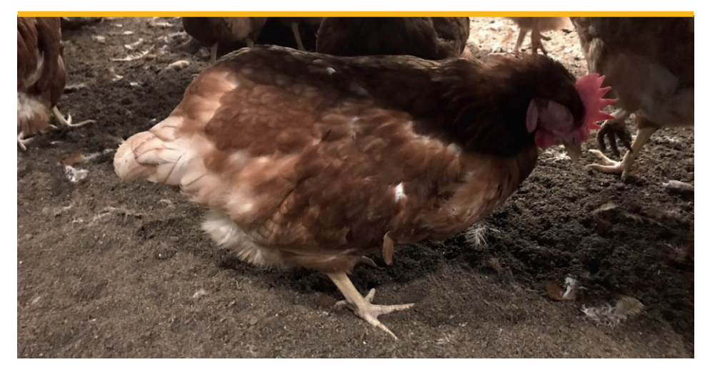
Chicken suffering from an infection with avian influenza

Besides further optimisation of the biosecurity, additional protection against avian influenza must be achieved through vaccination of poultry. Unfortunately, no vaccines are available whereby the vaccinated animals no longer spread the virus following infection. Vaccination can only help shorten the period of spread and reduce the volume of virus shed. The existing older generation vaccines only protect against the AI subtype included in the vaccine; they often cannot even provide protection against AI viruses of the same H subtype. An optimal vaccination scheme will need to use second or third generation vaccines. We know that these vaccines offer broader protection. However, there is the issue of these vaccines not yet being registered in Europe, that we are unaware of the length of protection offered and whether the protection of a vaccinated flock is also sufficient to prevent transfer of the virus from farm to farm in the event of a field infection. A field experiment intended to answer these questions is currently under preparation.