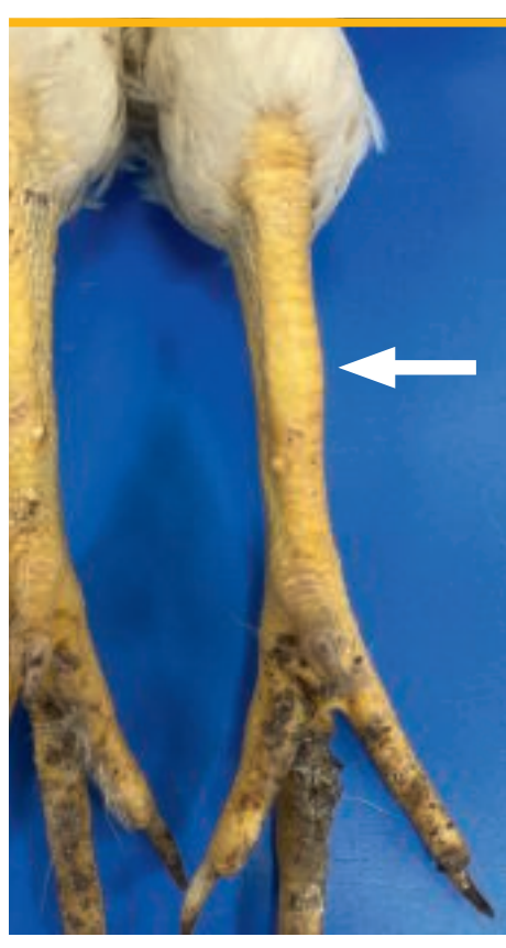
Photo 1. This young hen has a swollen tendon sheath (arrow). Reovirus was found in the tendon sheath, along with microscopic symptoms of a viral inflammation